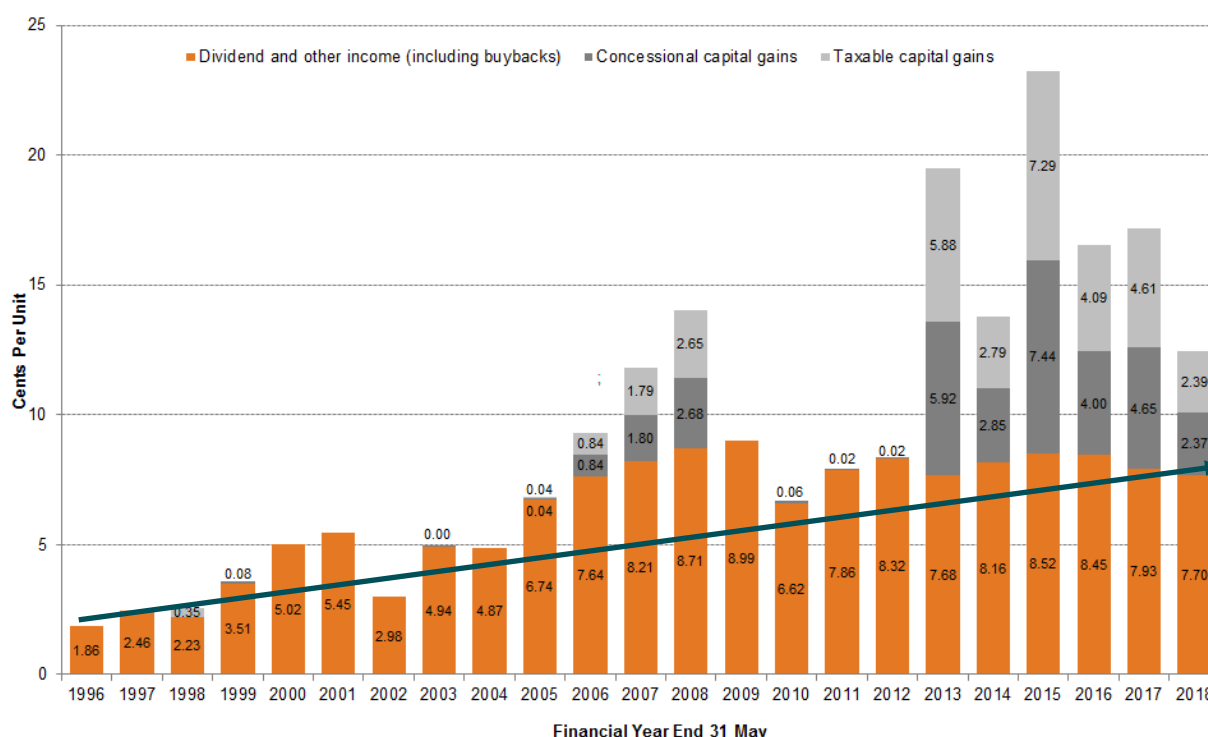
Chart 1: MLC IncomeBuilder annual distributions

Distributions are calculated net of fees.